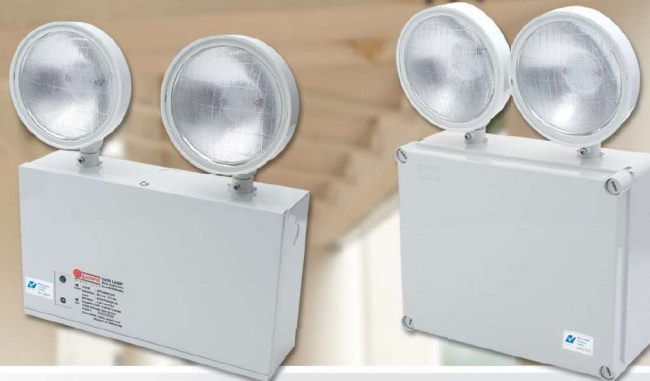
● MTL/NM/L203 NC